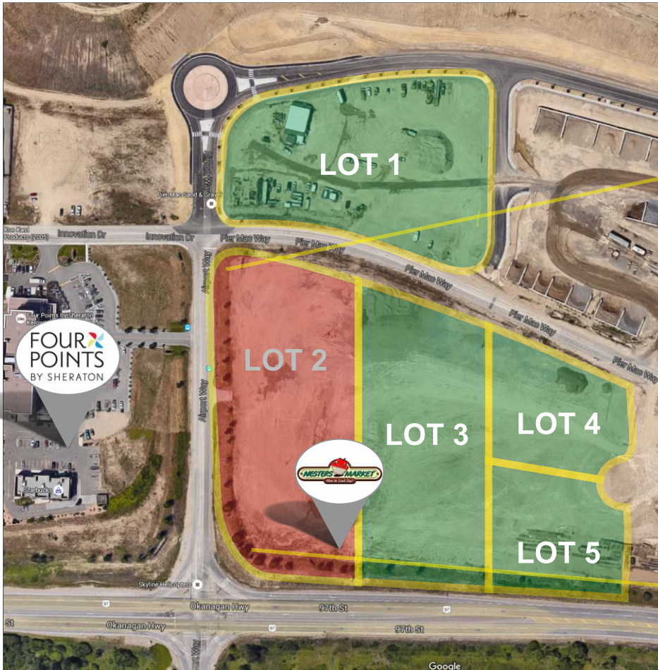
Planned Lot 2 Development