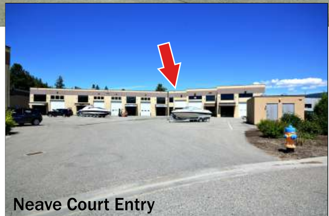
Neave Court Entry

Lot lines for demonstration only. Actual lot lines and property boundaries to be verified by survey and municipal plans.